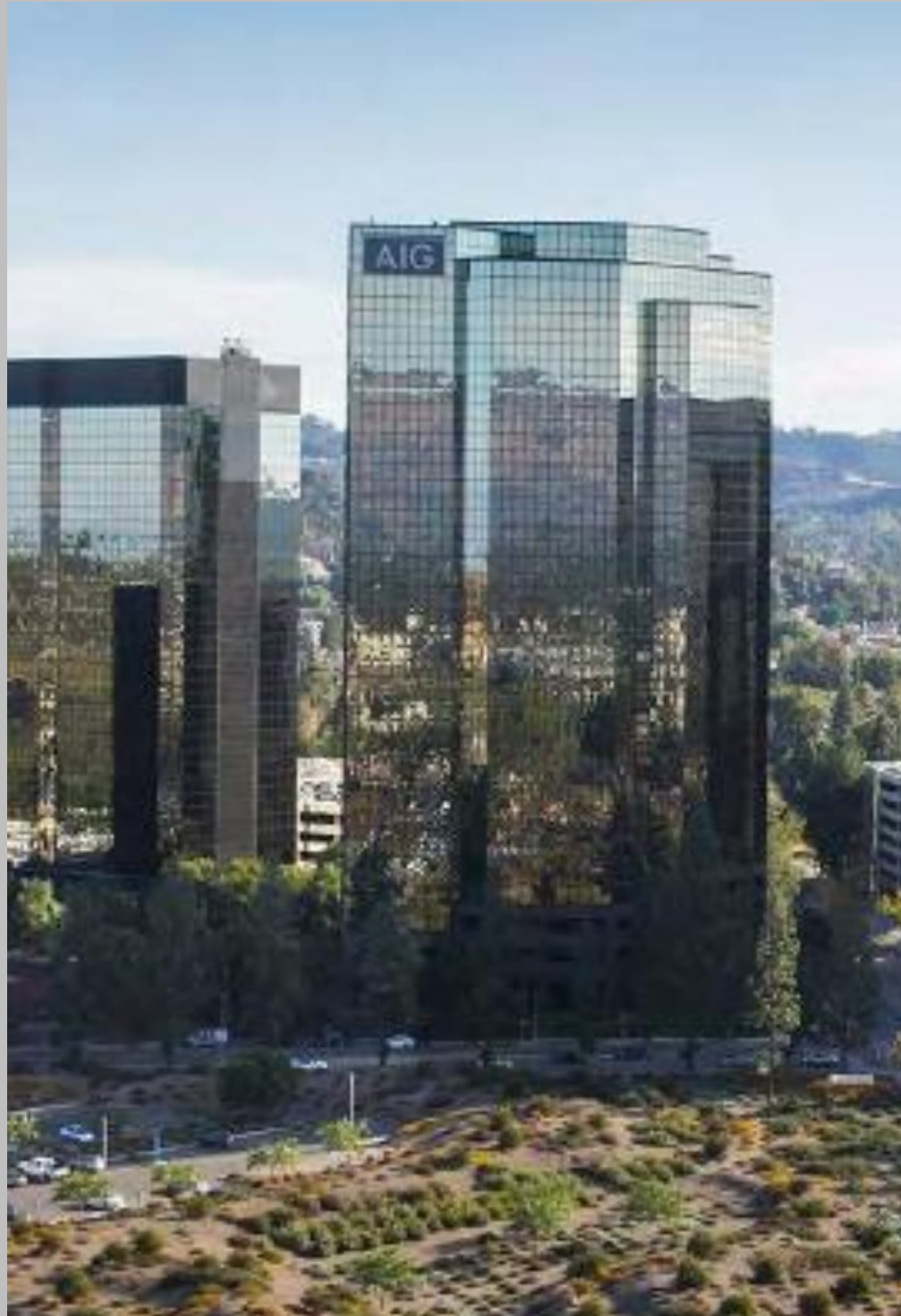
SLC Los Angeles Office Warner Center Towers 21550 Oxnard Street Suite 1000 Woodland Hills, CA 91367