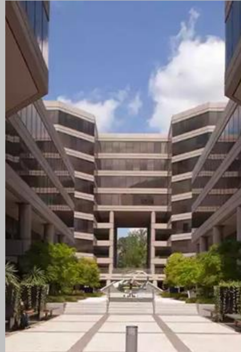
SLC Atlanta Office Piedmont Center North 3565 Piedmont Road Building One, Suite 400 Atlanta GA 30305